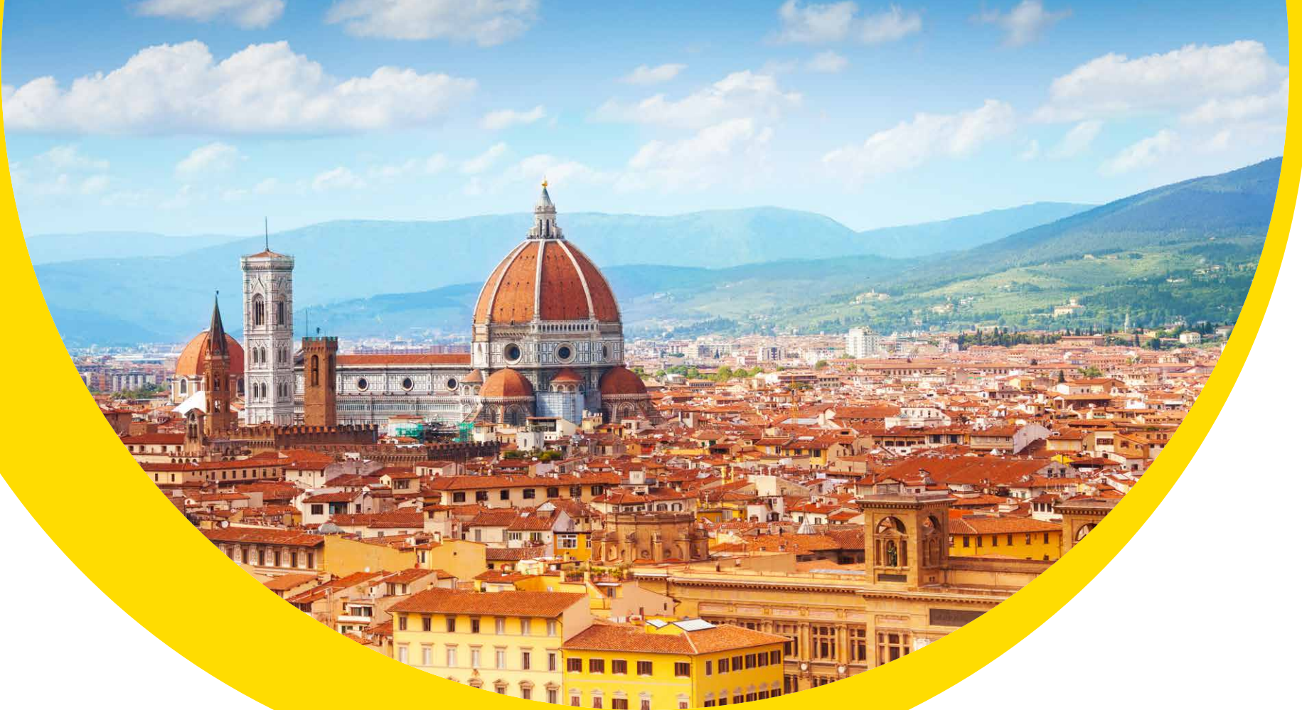
Florence Duomo Florence, Italy

and the Baptistery with its Gates to Paradise. Also see the Piazza Della Signoria – an open-air museum crammed with Renaissance sculptures, edged by historic cafes and presided over by the magnificent Palazzo Vecchio and the famed Ponte Vecchio (bridge) across the River Arno. Next, drive to Piazzale Michelangelo to get a spectacular panoramic view of the city. Later proceed towards Pisa. On arrival see the Square of Miracles with the stupendous Leaning Tower of Pisa.