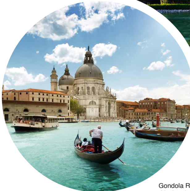
Gondola Ride Venice, Italy