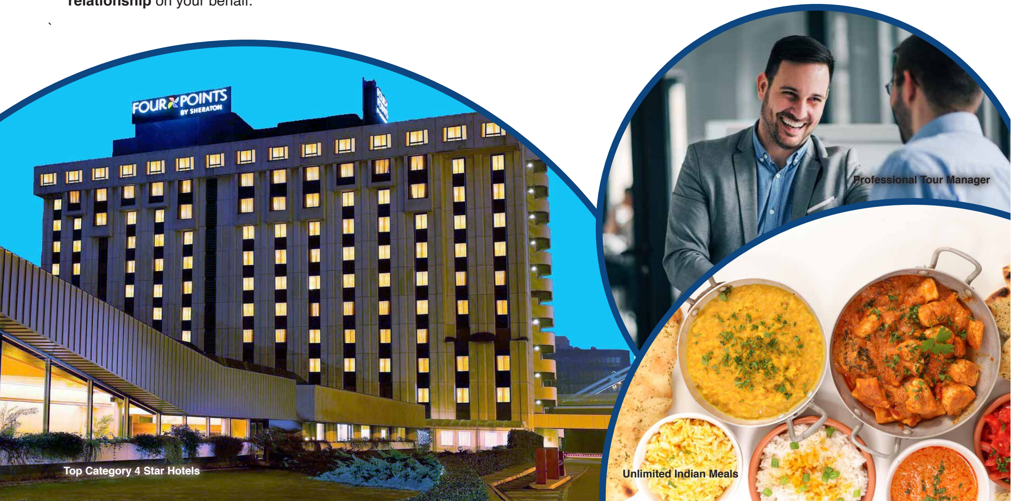
Top Category 4 Star Hotels