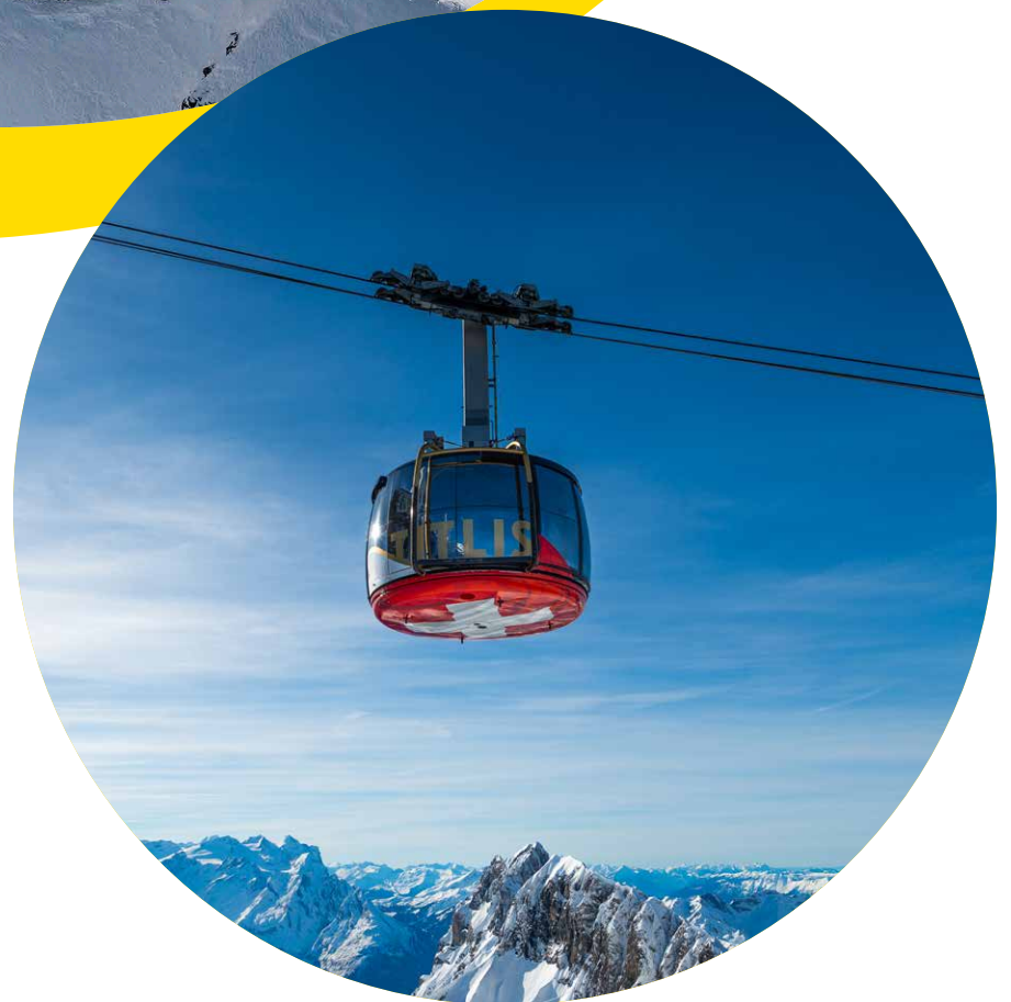
Mt. Titlis - ROTAIR Engelberg, Switzerland

Today enjoy amazing scenery, a once in a lifetime experience with an exhilarating tip to the top of Mt Titlis at 3020 metres on various cable cars including Rotair, the world's first revolving cable car. Get a breath taking unrestricted 360 degrees stunning view of the dazzling snow capped peak, deep crevasses and pristine white snow fields, dotted with massive ice boulders from every angle. Do not forget to visit the “Cliff Walk” the highest suspension bridge in Europe along the cliff of Mt. Titlis.