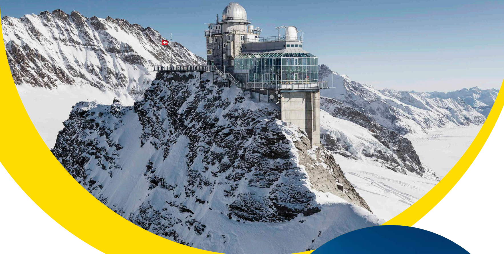
Sphinx Observatory Grindelwald, Switzerland