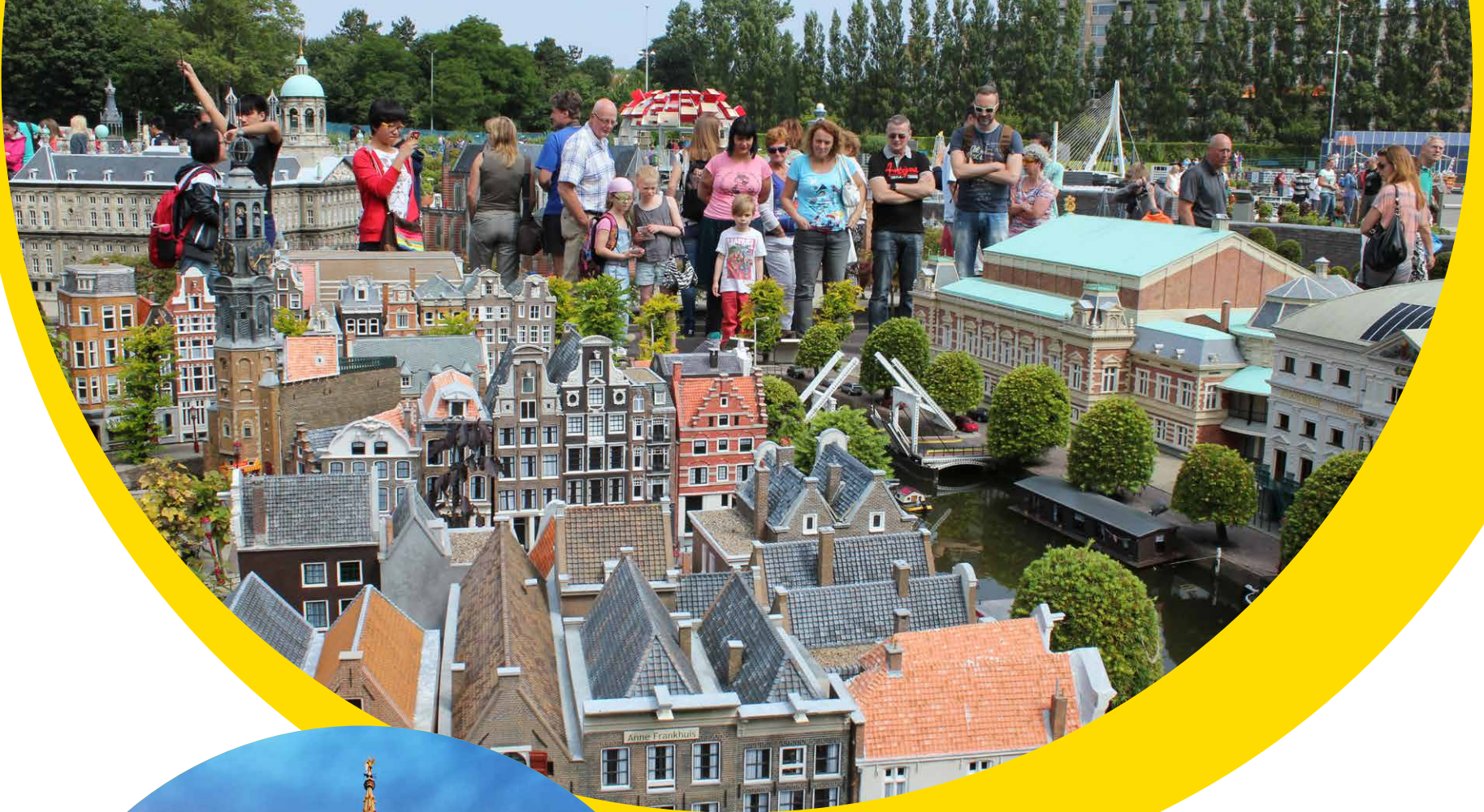
Madurodam The Hague, Netherland