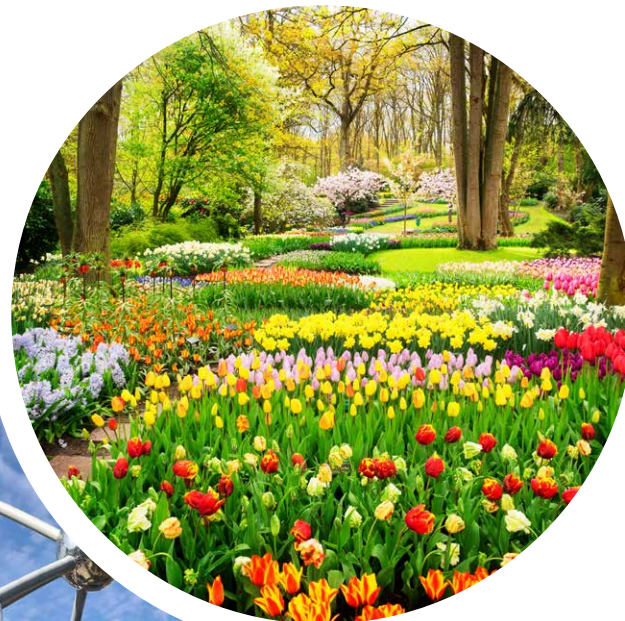
Keukenhof Gardens Lisse, Netherland

Overnight in Netherland. (Breakfast, Lunch, Dinner)