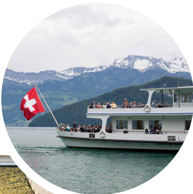
Cruise on Lake Lucerne Lucerne, Switzerland