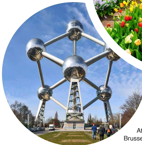
Atomium Brussels, Belgium