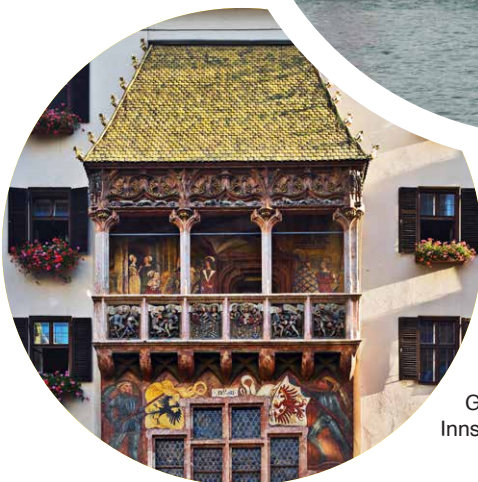
Golden Roof Innsbruck, Austria

Later proceed on an orientation tour of Lucerne one of most beautiful cities in Switzerland. Visit the Lion Monument, Kapell Brücke with some free time to shop for famous Swiss watches, knives and chocolates. Enjoy a scenic cruise on the lake of Lucerne.