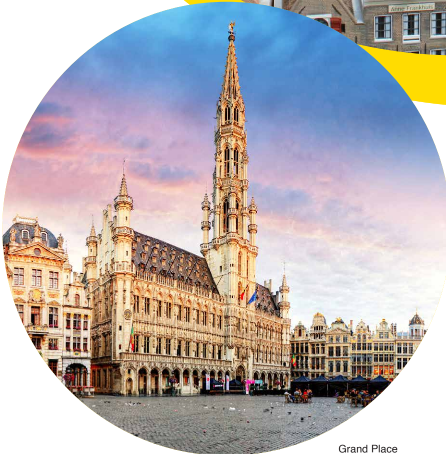
Grand Place Brussels, Belgium