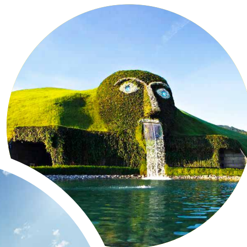
Swarovski Museum Wattens, Austria

This morning check out and drive to Florence – the cradle of the Renaissance. Along with your English-speaking local guide, walk and absorb into the culture of the historic city. View the Duomo – the city's most iconic landmark, the Campanile