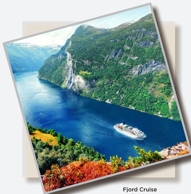
Fjord Cruise Naeroyfjord, Norway

Overnight in Oslo. (Breakfast, Lunch, Dinner)