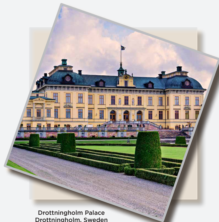
Drottningholm Palace Drottningholm, Sweden

Overnight on board the Silja Line Cruise. (Breakfast, Lunch, Dinner)