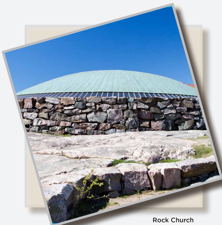
Rock Church Helsinki, Finland

Your memorable Holiday ends, today it's time to fly back home. Say goodbye to the wonderful new friends you have made on the tour. Check out and depart for the Airport with pleasant memories of your European trip which you will cherish for a lifetime. (Breakfast)