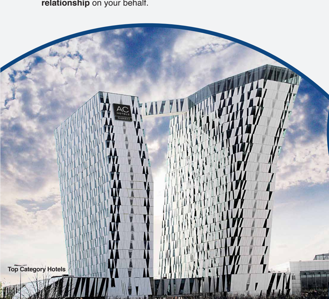
Top Category Hotels