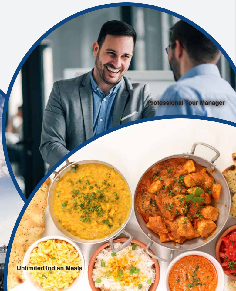
Professional Tour Manager