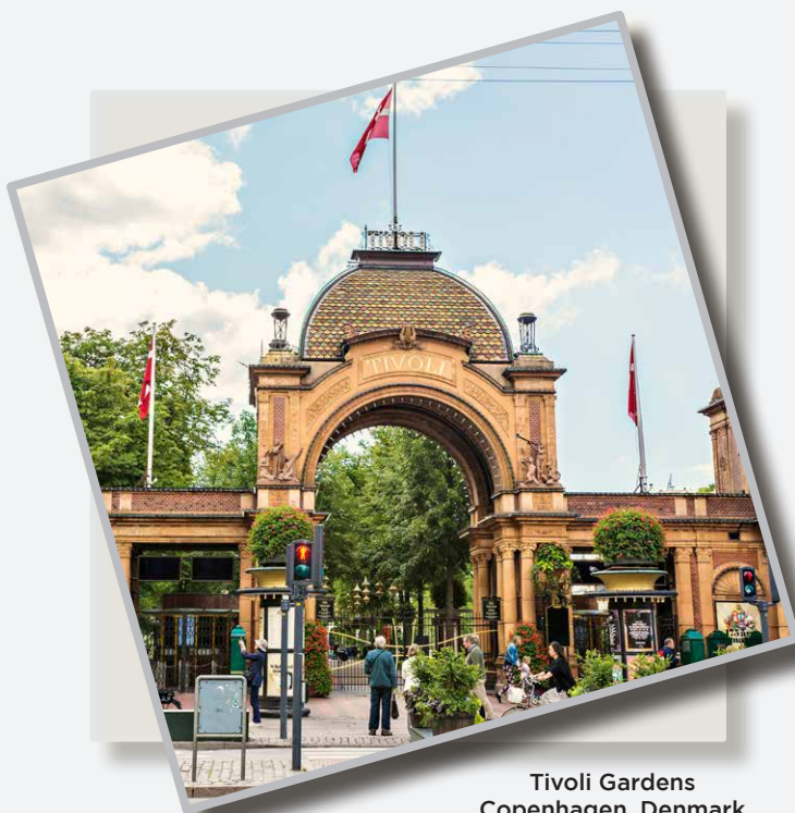
Tivoli Gardens Copenhagen, Denmark

Overnight in Geilo. (Breakfast, Lunch, Dinner)