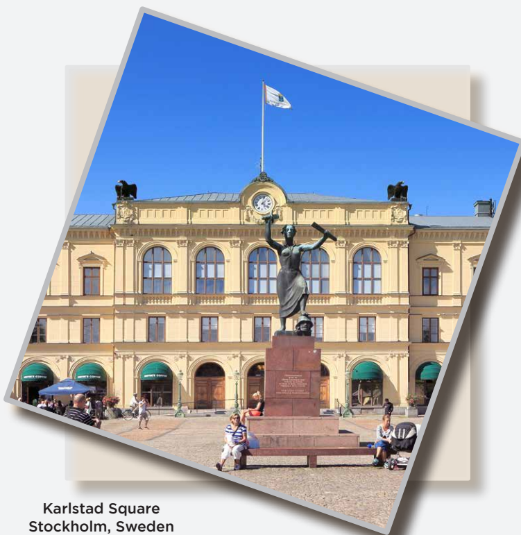
Karlstad Square Stockholm, Sweden

This morning you will meet your local guide at the hotel Lobby and proceed on a guided tour of the city of Stockholm often referred to as the Venice of the North. Visit Fjällgatan to see the magnificent view of the Swedish capital, spread out on 14 islands with Lake Mälaren on one side and the Baltic Sea on the other. See