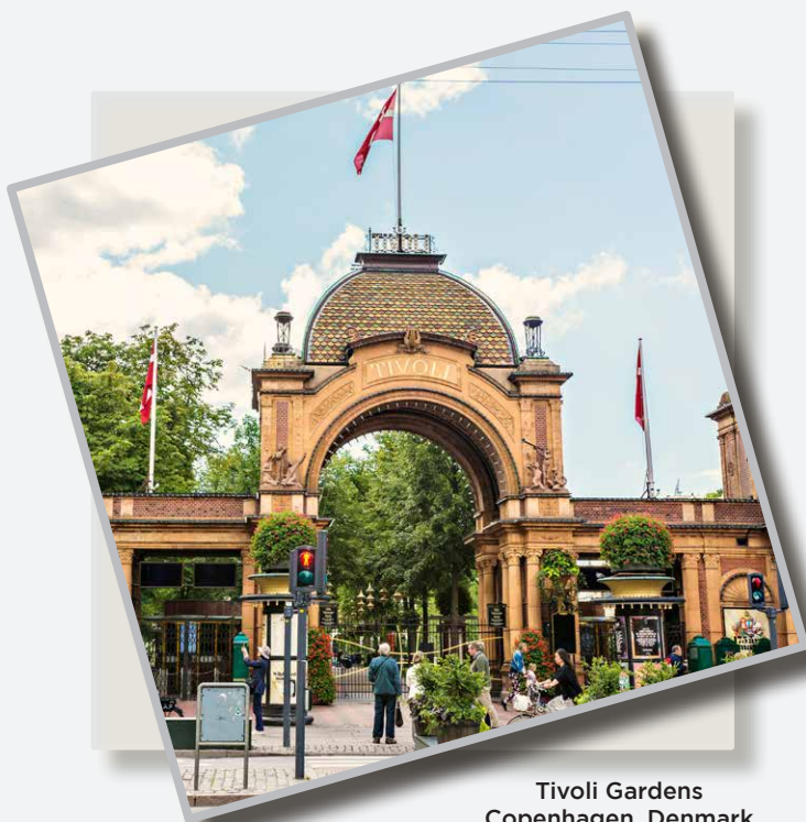
Tivoli Gardens Copenhagen, Denmark

Overnight in Geilo. (Breakfast, Lunch, Dinner)