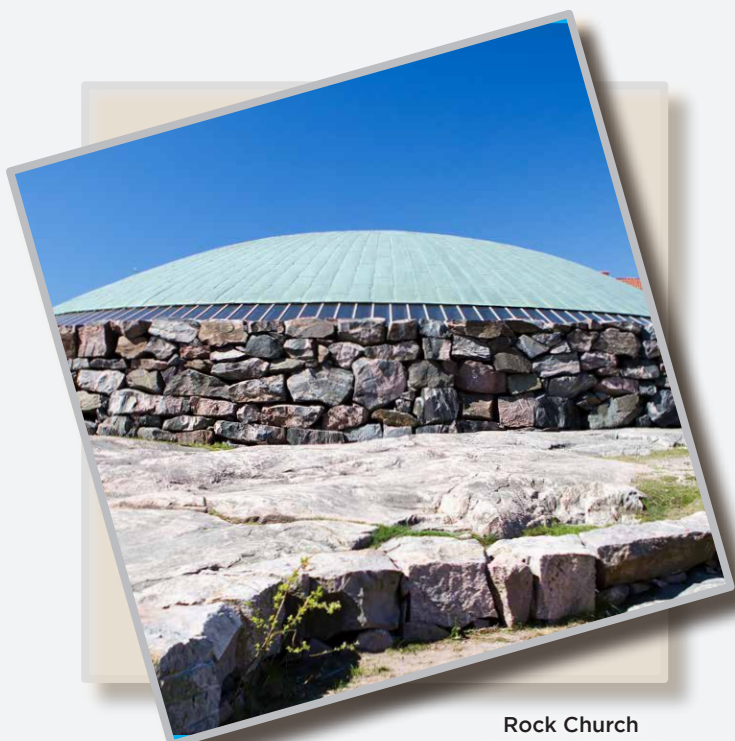
Rock Church Helsinki, Finland

Your memorable Holiday ends, today it's time to fly back home. Say goodbye to the wonderful new friends you have made on the tour. Check out and depart for the Airport with pleasant memories of your European trip which you will cherish for a lifetime. (Breakfast)