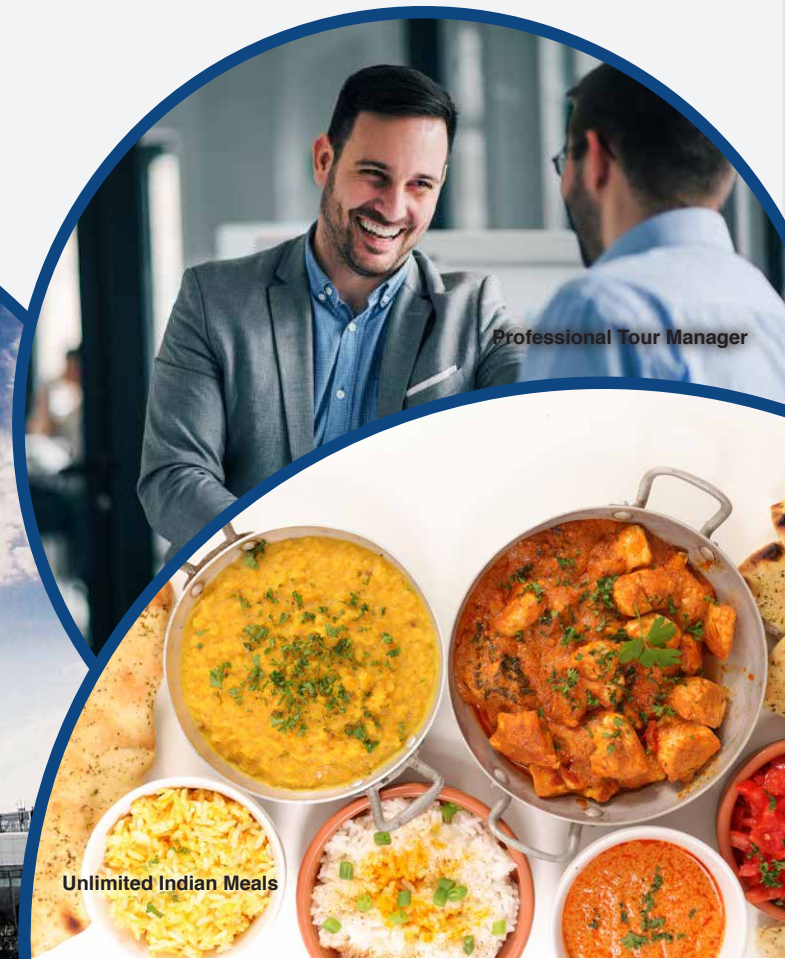
Professional Tour Manager