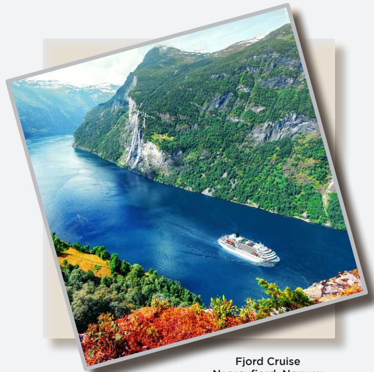
Fjord Cruise Naeroyfjord, Norway

Overnight in Oslo. (Breakfast, Lunch, Dinner)